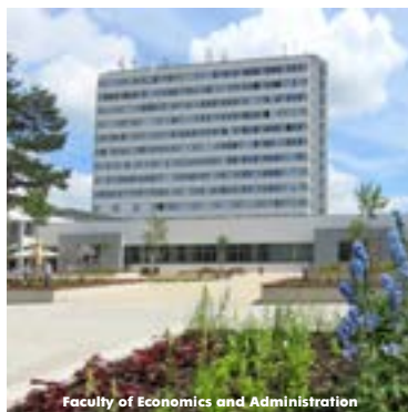
Faculty of Economics and Administration