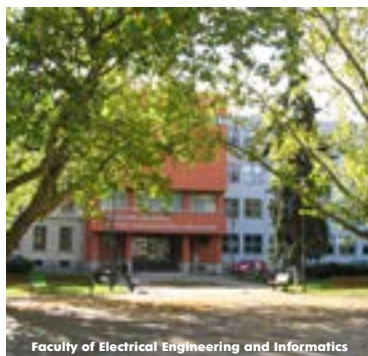
Faculty of Electrical Engineering and Informatics